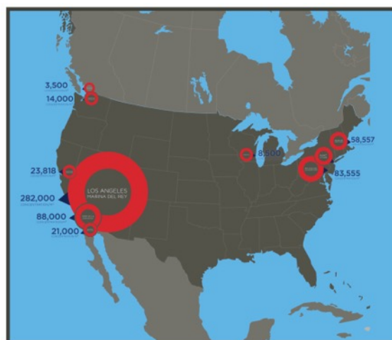
Figure 4: A visual representation of the average concentration of trash found in each harbor.