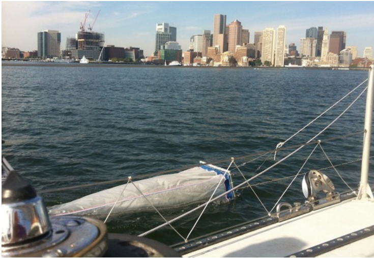
Photo 1: A neuston tow being conducted off Rozalia Project's 60 ft sailing vessel, the American Promise , in Boston Harbor. A neuston tow captures objects floating in the neuston layer, the area where the surface of the water meets the air.

Samples were collected in 10 urban harbors using a neuston net, towed off of various vessels. Each sample was inspected for manmade items, either floating on their own or clinging to organic material.