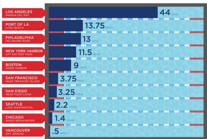
Figure 3: This infographic represents the number of pieces of trash one would hit if they were swimming one length of an Olympic-sized pool with a concentration the same as in one of the studied harbors.